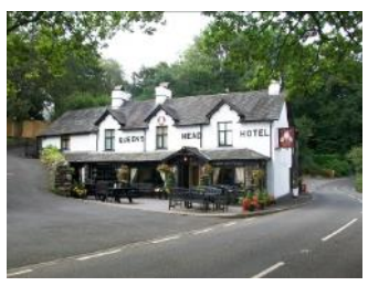
The Queens Head Hotel, Troutbeck

After a relaxing and enjoyable cruise to Pooley Bridge, at the North end of Ullswater and then back to Glenrydding, we set off back through Patterdale and stopped at the Brotherswater Inn in Hartsop for refreshment. This is a fairly nondescript pub but comfortable nonetheless. Real ales available were Barngates Tag Lag (4.4%), Tirril 1823 plus Jennings Bitter and Cumber -