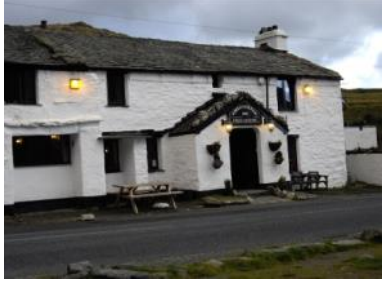
The Kirkstone Pass Inn

and Cumberland Corby Ale . Later in the week, we arranged to meet up with our friends at the historic Kirkstone Pass Inn, just short of the summit of the pass. Records for the Kirkstone Pass Inn date back to 1496 and are believed to be linked to a 15<sup>th</sup> Century monastery. At nearly 1500 feet above sea level, it is the highest inhabited building in Cumbria and the third highest Inn in England. Three real ales are normally available and, on this occasion, the choice was Tirril Charles Gough's Old Faithful , Thwaites' Wainwright and Langdale Tup .