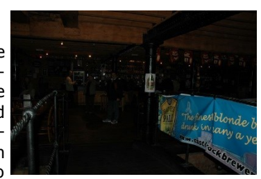
The Canal House—complete with narrowboat

First stop on our tour of Nottingham pubs was the Canalhouse, a short walk away or a slightly longer minibus tour of Nottingham's one way system. One of Castle Rock's own pubs, the Canalhouse is housed in a listed former canal museum. For a pub it has the unique distinction of the canal arm coming into the building, with room for two canal boats and a bridge over leading into the main bar area. Once we had visited the bar, which had Castle Rock's own Harvest Pale and Elsie Mo as well as a beer each from Salopian, Ossett and Black Country,