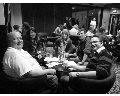
Solihull Beer Festival 2010—laid-back or what??

Our theme this year is 'Urbs versus Rure' (a pun on the Solihull motto of 'Urbs in Rure' - the Town in the Country) so there will be a wide and varied choice of beers to represent both, and as well as voting for your favourite Beer of the Festival, you will be able to vote for 'Urbs' or 'Rure'.