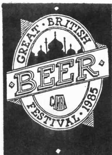
THE GREAT BRITISH BEER FESTIVAL, 1985

It was reported in an earlier "Boro Banter" that the GBBF was to be held at The Metropole in Brighton. However, since then a few more details have been finalised. The festival will be held in the Exhibition Halls behind the hotel which is situated on the sea front, in Kings Road.