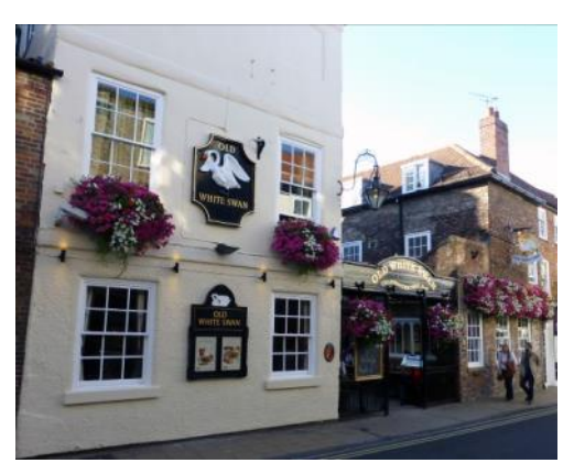
The Old White Swan

Walking around the city walls, lunch was taken at the Rose & Crown, accompanied by yet more Golden Sheep. After a tour of York Minster – briefly interrupted by a fire alarm – we headed for the Old White Swan for dinner.