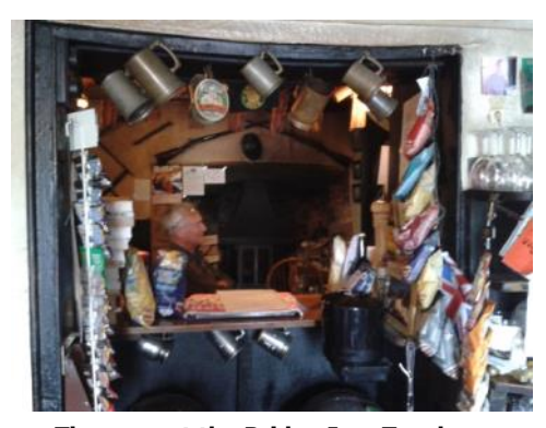
The snug at the Bridge Inn, Topsham

The second pub also had connections with a famous lady, as the Grade II-listed Bridge Inn at Topsham is one of the very few pubs ever visited by the Queen, in 1998. With high backed set-