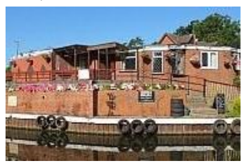
Coming Soon: Sadlers Brewery Cask Ales!

price reduction. In addition, this offer cannot be used in conjunction with any other promotion at the club.