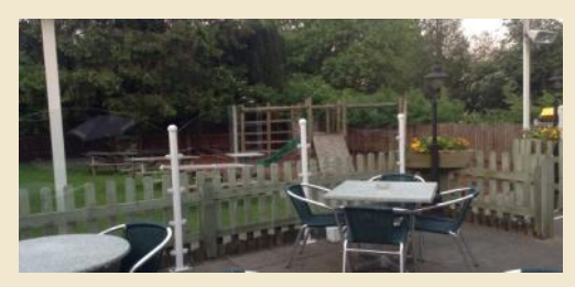
Secluded, peaceful beer garden & children's play

Upcoming Guest Beers; Mercia IPA, Derby Brewing Co; OSM, Cotswold Spring Brewery; Red Dawn, Red Squirrel Brewery