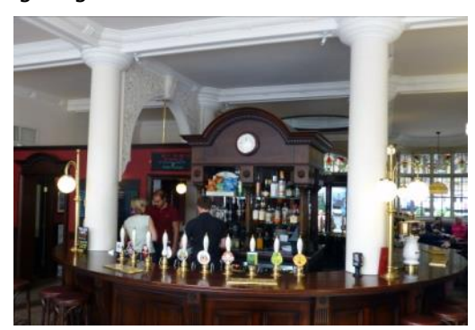
One half of the bar in the York Tap

It's worth noting that there are a lot of pubs in Whitby, far more than you might expect for a town of its size; the large number of tourists goes quite a long way to explaining this. It's also interesting that none of the three GBG-listed pubs offer food; perhaps combining serving food to hordes of tourists and keeping good real ale is difficult to get right.