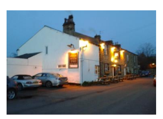
The Swan with Two Necks at night

I had wondered if a quick bite to eat might have been possible but the place was packed, even though it was only 6.15pm, so it was liquid refreshment and a packet of crisps! There were 5 real ales on and as I still had 120 miles to drive I settled for their "float of 3 thirds". 'Jushua Jane' (Ilkley Brewery, 3.7%) was a very tasty nut brown Yorkshire ale and the 'American Pale Ale' (Dark Star Brewery 4.7%) was just what it said on the pump clip but my favourite was 'Lights, Camera, Action'