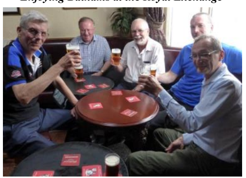
Enjoying Bathams at the Royal Exchange

A visit to Lang's the Butchers to stock up on sustenance ensured that by the time we dropped into Batham's Royal Exchange we were suitably thirsty for more of their distinctive Black Country beer. The visit concluded at the Duke William in Stourbridge town centre, where the activation of a smoke alarm didn't interfere with our enjoyment of 8 hand pulled beers.