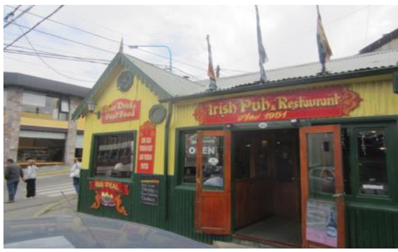
Above: Bar Ideal, Ushuaia, Argentina

Ushuaia is the capital of Tierra del Fuego, Argentina. In the language of the native Yagan people it means "inner harbour to the west", and is the main port for cruise ships heading for Cape Horn or the Antarctic Peninsula, which is why most people visit this 'Fin del Mundo' town.