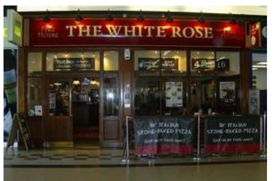
Leeds Station pub The White Rose

arrived and were perusing the choice of ales available, which were Springhead Outlawed, Harviestoun Old Engine Oil, Hop Studio XS (Extra Special), Naylor's Pinnacle Porter, Greene King Abbot and IPA, Sharps Doom Bar, Theakston Old Peculier and Ilkley The Mayan.