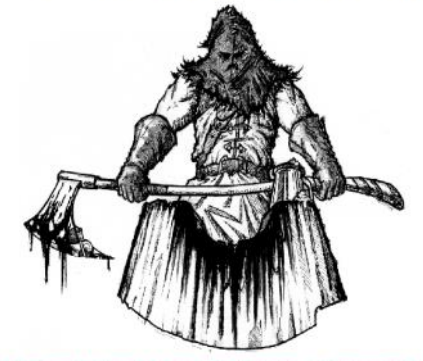
HOPE YOU'RE NOT SCARED OF THE DARK... EXECUTIONER'S PORTER

ONLY WATER, MALT, HOPS AND YEAST. JUST HOW HE'D HAVE DRUNK IT!