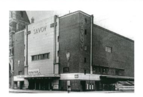
FROM PICTURES TO PINTS:

The cinemas, many of which date back to the film heyday of the Thirties, range from the mundane to the wonderfully elaborate, and many of the original features can still be seen.