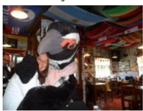
Above: A tourist makes a new friend

I can't remember most of the other bars we called in at but one served a delicious 8% red beer "La Burra" brewed at the other end of Argentina at Salta not far from the Bolivian border. On a spare day I hiked up to the snout of the Martial Glacier and was able to pick up a cheap 970ml bottle of "Iguana Summer" beer