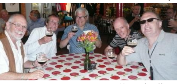
Above: Ouaffing samples in the centre bar area

After our tour and an inspection of the fascinating items in the brewery museum, we settled in the bar area of the visitor centre and a veritable plethora of Hook Norton ales came our way.