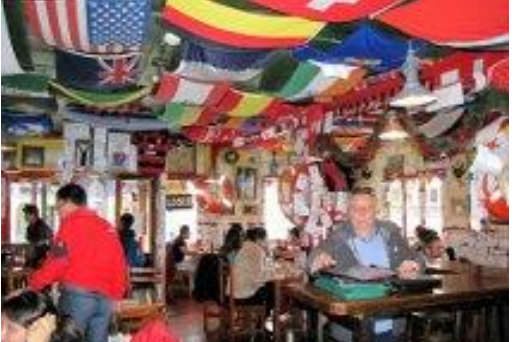
The bar in the Ukrainian base 'Vernadsky'