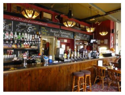
The bar at The Plough Inn, Wollaston

A short saunter brought us to the first of two Batham's pubs, The