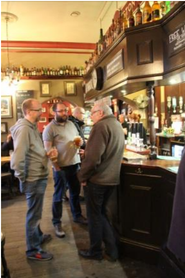
The West Riding Refreshment Rooms, Dewsbury Station

Nutty Thwaites Black, Timothy Taylor Landlord, Sky's Edge Hop Master and Stateside Pale, Ilkley Dunkel and Sunbeam Blinded by the Light, I the opted for latter (4.0%), a single hopped pale ale using Citra hops, making for a pleasantly refreshing beer with a citrussy, hoppy bite.